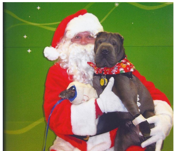
Santa even posed for a picture with Buster!!

On December 11 , we helped Santa Claws take pet pictures