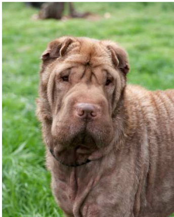
Sadie Mae was adopted

PetSmart National Adoption Weekend May 5