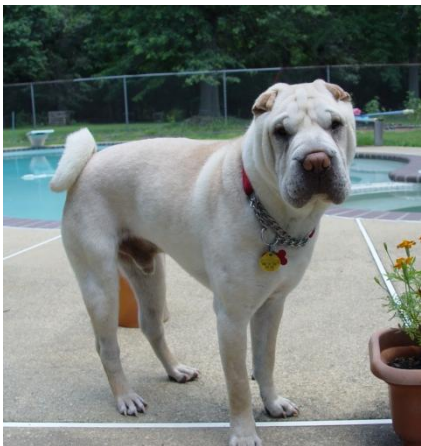
Miyagi aka Mr. Lee

We were at Unleashed in Olney in late June and Miyagi left us for his forever home.