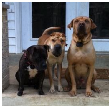
Bobby, Max, and Joey (AKA Rush)

We were at Bark! In Kentlands in early June. Max, our shy boy and Rush were both soon on their way to Indian Head, MD and a new home.